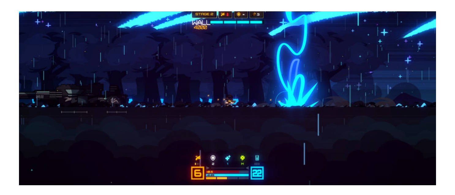
SAS: Zombie Assault 4 Download Crack Serial Key